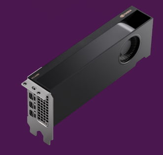
NVIDIA RTX<sup>™</sup> A2000 12GB Graphics Card<sup>7</sup> PN: 4X61J52232

For a full list of accessories and options, please visit: accsmartfind.lenovo.com