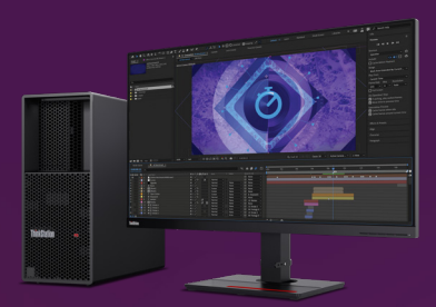
ISV Certifications Certified by leading industry software application vendors